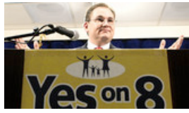
Defense Set to Press Gay-Marriage Case