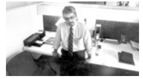
A Mercurial Advertising-Industry Pioneer