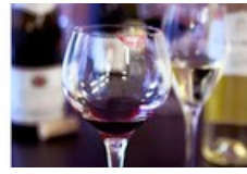
New Approaches to Judging Wine