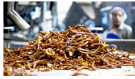
Angry Squeals Over Pork-Rind Imports