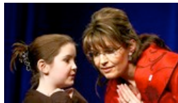
Palin Upsets Fans by Backing McCain