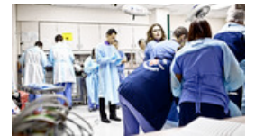
New York Hospitals Under the Knife