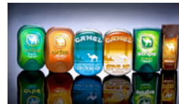
Smokeless Products Are Test for Reynolds