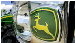
Companies Take Health-Care Charges