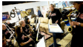
Swing Band Honors Japanese Internees