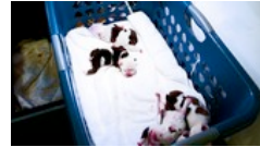
States Nip at Dog Breeders