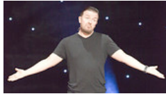
A Holiday Message from Ricky Gervais: Why I'm An Atheist