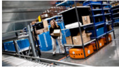
Holiday Help: People vs. Robots