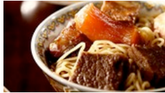
The World's Most Expensive Noodles?