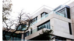
Hong Kong's Most-Expensive Homes