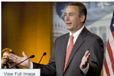
View Full Image John Boehner

How would he know? Speaker-presumptive John Boehner will be responsible for winning on the House floor, and he's already invited Mr. Obama to combine the Colombia pact with the Panama and South Korea trade deals into a single package for one vote. This would allow trade supporters to concentrate their support, rather than make Members face the hostility of Big Labor three separate times.