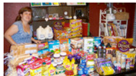
Coupon Clipping Is Newest Extreme Sport