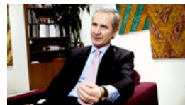
Sales Makeover for Estée Lauder