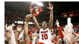
Wait, What Happened to February?