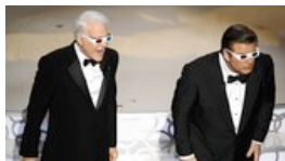
'Hurt Locker' Wins Best Picture Oscar