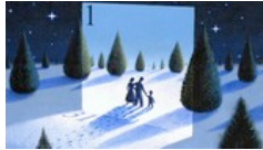
Better Relationships in 2011