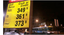
The Cost Of Driving: Gasoline Rises Above $3 Per Gallon