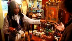
Troubled Times, Web Give Hoodoo New Life