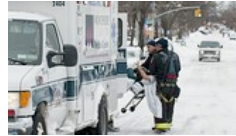
Snow Hinders Emergency Responders