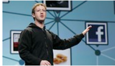
Hot Trade in Private Shares of Facebook